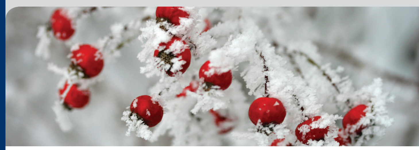
KeepRite® furnaces come with the newest heating technology and quality components to give you the ultimate in climate control. You get outstanding quiet, maximum energy savings, and exceptional warranties to assure you of long-lasting satisfaction.