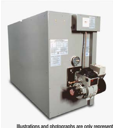
Illustrations and photographs are only representative. Some product models may vary.